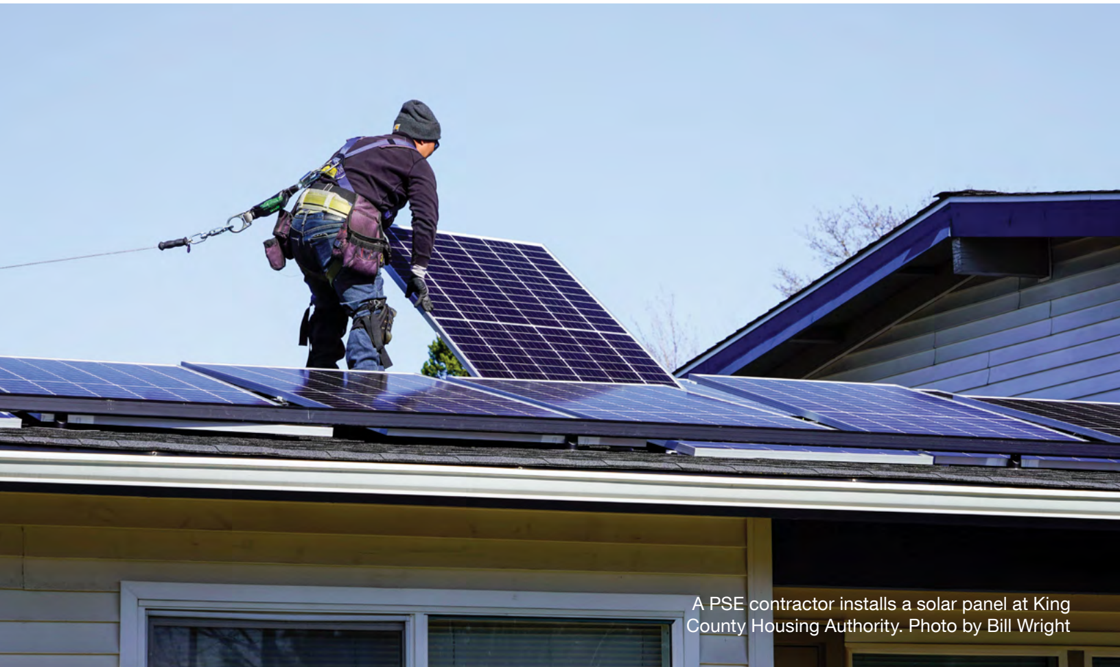
A PSE contractor installs a solar panel at King County Housing Authority.

The latest news on what's powering our neighborhoods